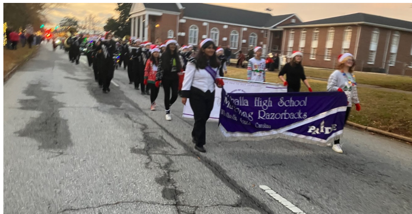
The band was in tune & kept us marching right along