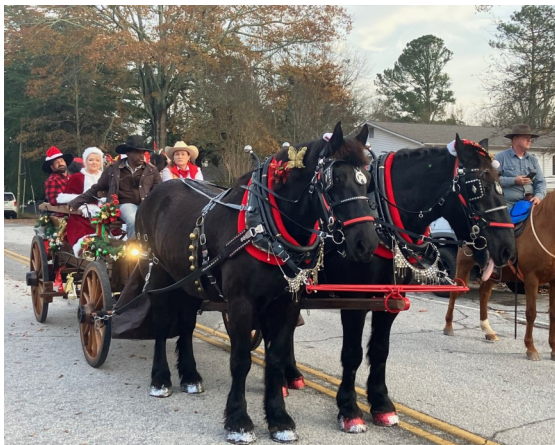
Different fuel sources but still about 2 HP each