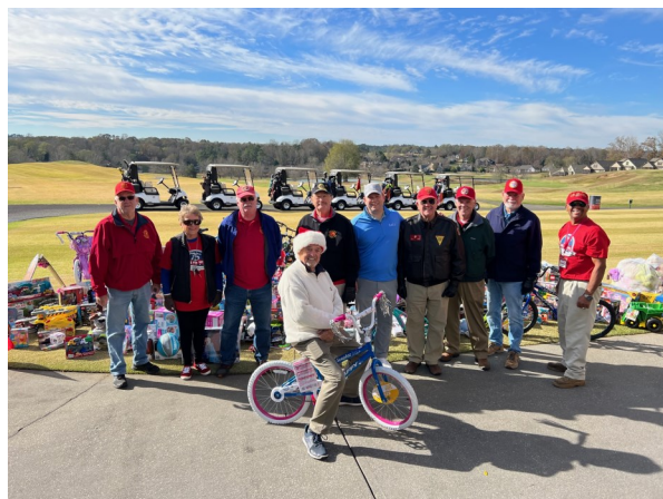
Santa's Helpers from Lewis G. Watkins Detachment #1131