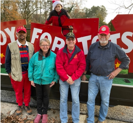
Parade line up in front of the Detention Center?