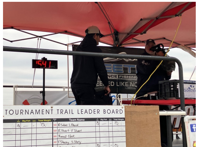
The fish haul was impressive — toys not so much. Entrants will bring toys next year to start of another TFT tradition.