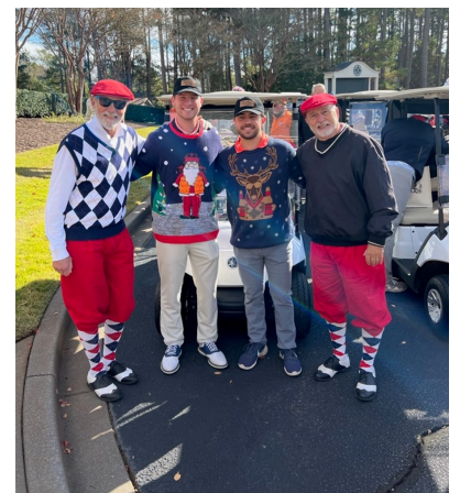
Dressed to the 9's and ready for 18!