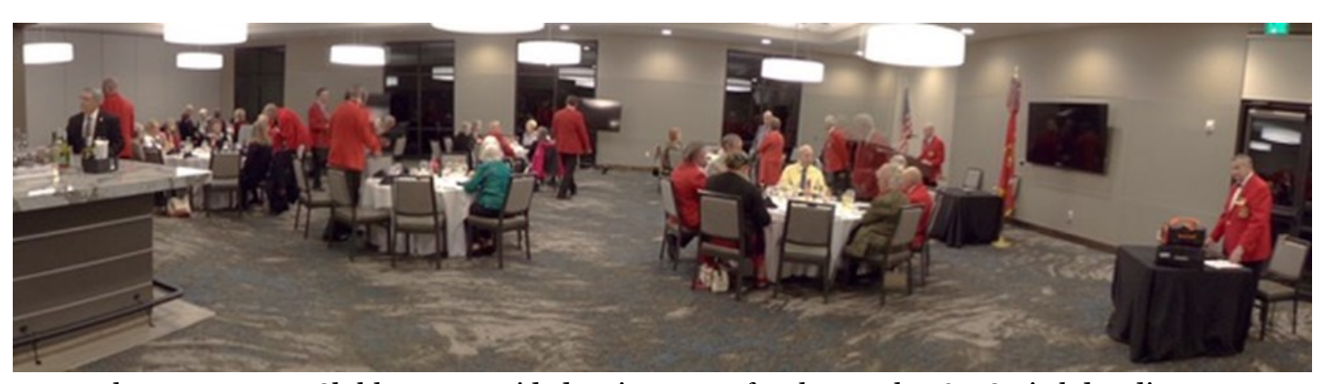
The Keowee Key Clubhouse provided a nice venue for the 247th USMC Birthday dinner