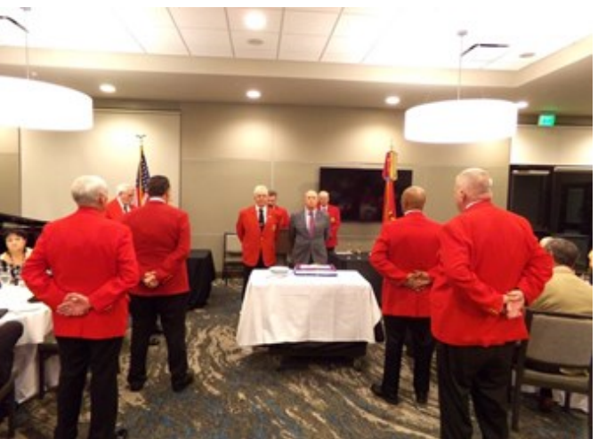
Cake Detail Front & Center