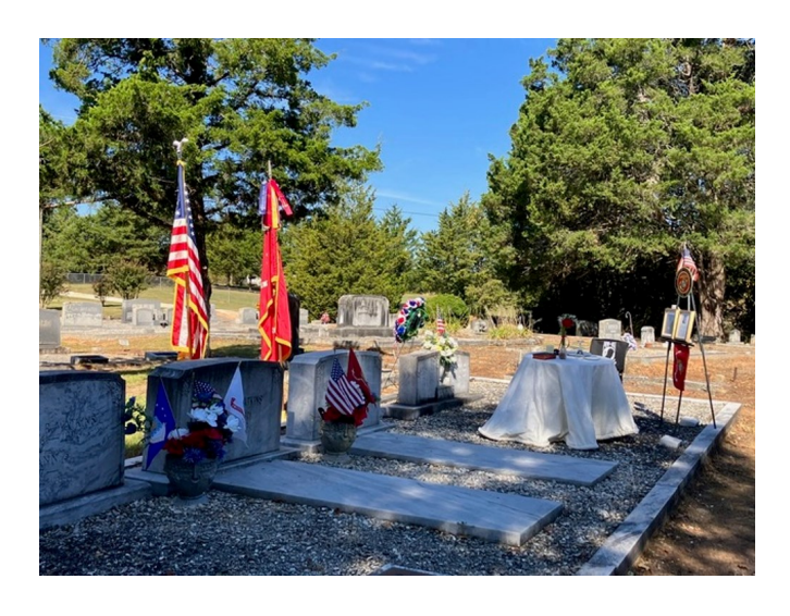
Another day of remembrance ... On the 70th anniversary of the death of Oconee County's only Medal of Honor awardee,