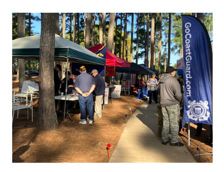
Some of the many military & service organizations that attended the 1st Annual Veterans Appreciation Festival at South Cove County Park on October 8, 2022.