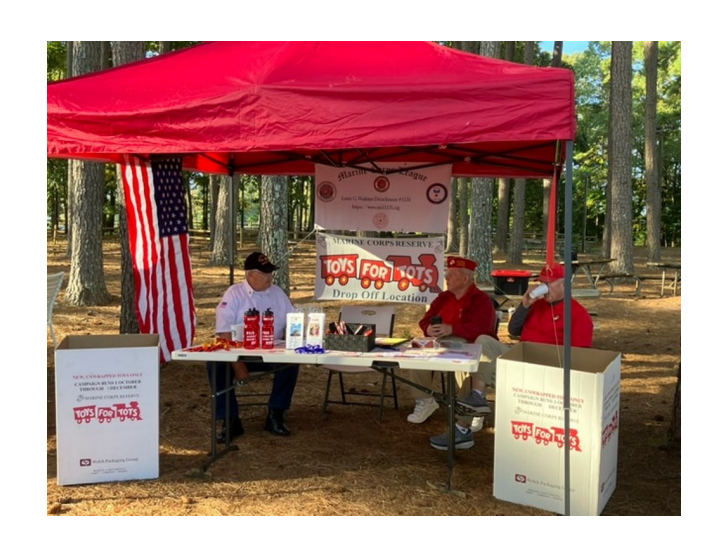
Something Marines & former Marines are used to — waiting. For guests and free chow (BBQ was on the County.) At least there was hot coffee.