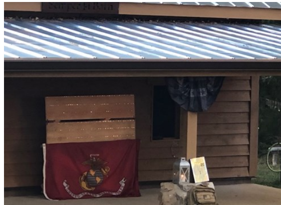
Several members of the LGW family attended a ceremony at the Semper Fi Barn in Six Mile to commemorate the 40th anniversary of the Marine Barracks bombing in Beirut, Lebanon. 241 service members lost their lives on October 23, 1983, Dog tags were placed in the barn. The Honor Guard was provided by Daniel High School JROTC.