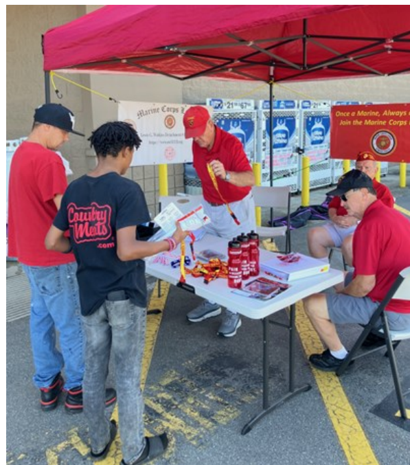
Another busy day at our last recruiting event for the year at Lowe's. The visitors to our booth are appreciative for our service and what we do for the community..