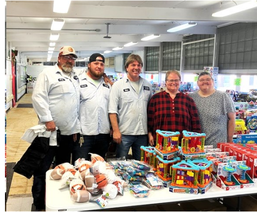
SCRHA shopped for Seneca, Walhalla & Westminster families