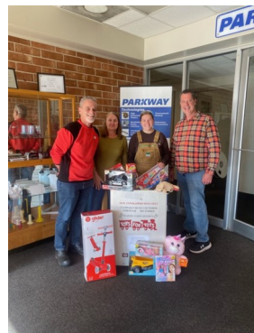
Keowee Key's Pickleball Club dinner netted 8 of 35 total boxes from Keowee Key club, fire station & marina..