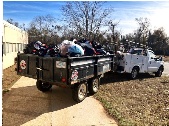
Sleighs came in all shapes & sizes