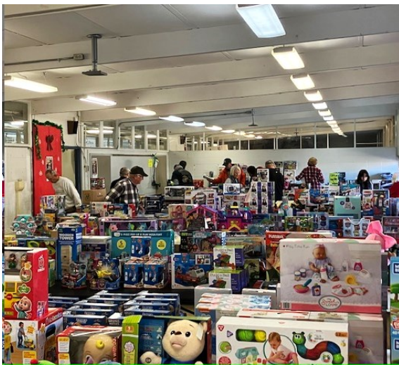
Plenty of WBC shoppers made quick work of the toy selection & transportation