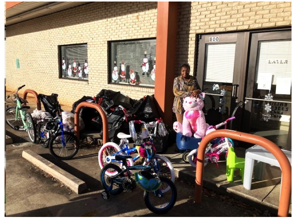
The Detachment shopped for & delivered to Smiling Angels Day Care Center