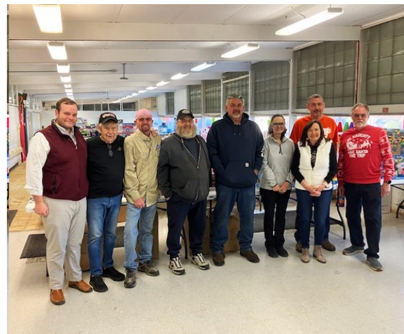
Salem-Tamassee area group