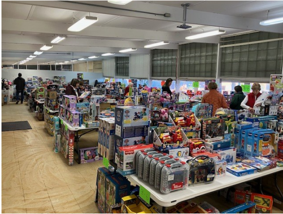
The store is officially open for business!