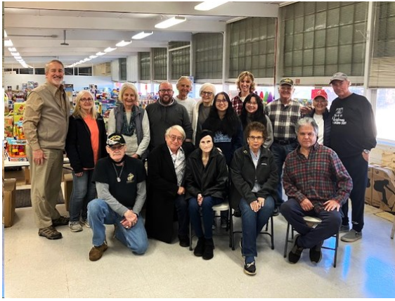
Westminster Baptist Church had the second largest group with over 100 children