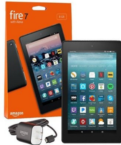
A generous donor provided 13 of the 40 of the Amazon Fire tablets handed out this year

Not pictured: Oconee Family Literacy Center & Nehemiah Baptist Church