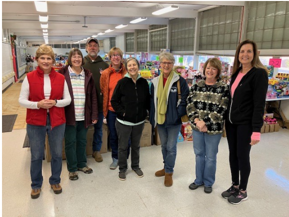
Walhalla — the largest group this year — shopped for 168 children in record time